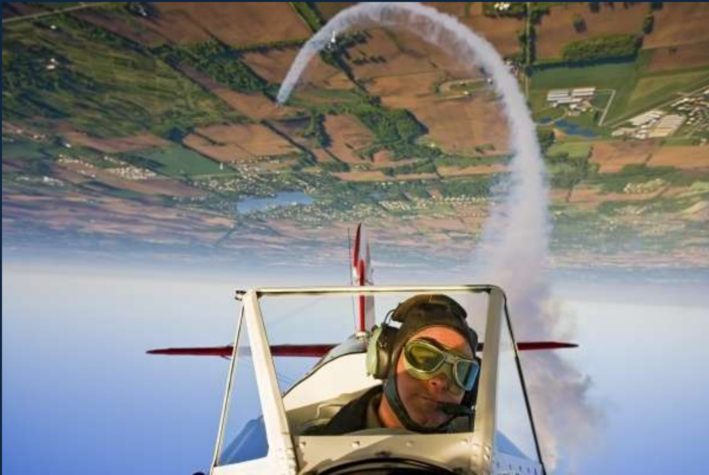
Boeing Stearman 450 Inverted