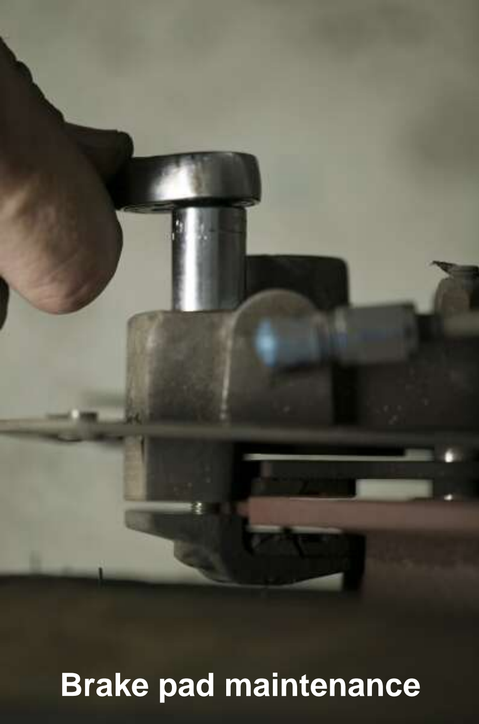
Brake pad maintenance