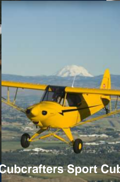
Cubcrafters Sport Cub