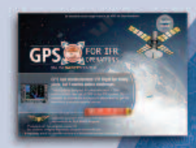
GPS for IFR Operations

Get the background you need to safely use GPS in the IFR system.