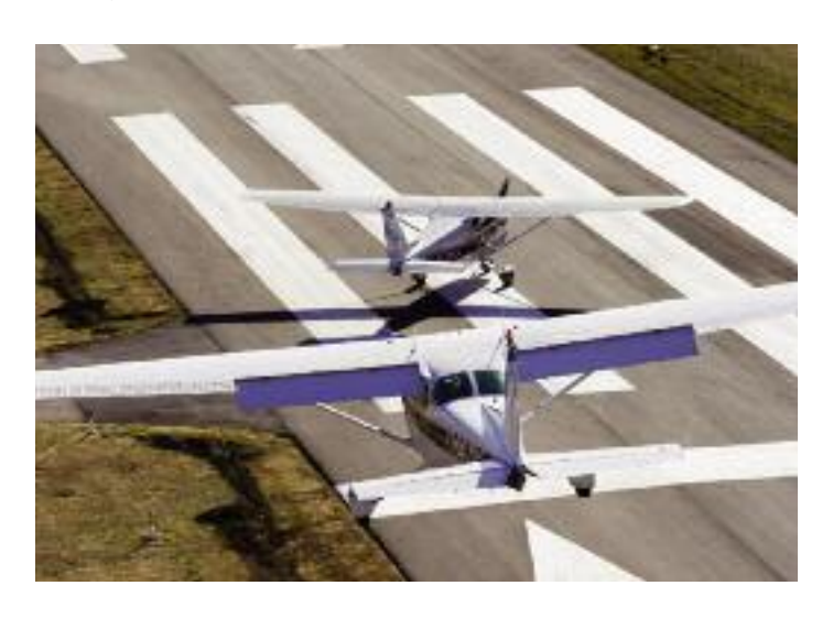
FAR 91.13(a): "No person may operate an aircraft in a careless or reckless manner so as to endanger the life or property of another."

Of course, all pilots strive to operate according to the FARs. But what should you do in the event of an emergency, an FAA ramp check, or an accident?