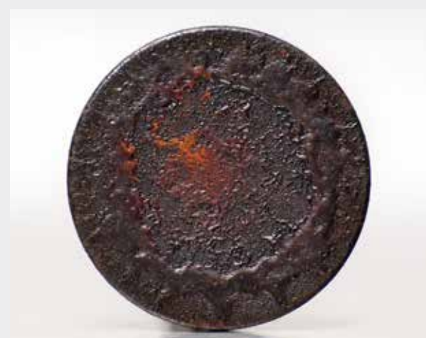
Thick lead deposits from an overly rich mixture give this healthy valve the appearance of an overcooked pizza.