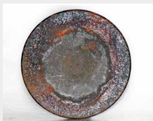
A symmetrical, circular pattern shows a healthy valve. Red and orange deposits are harmless.