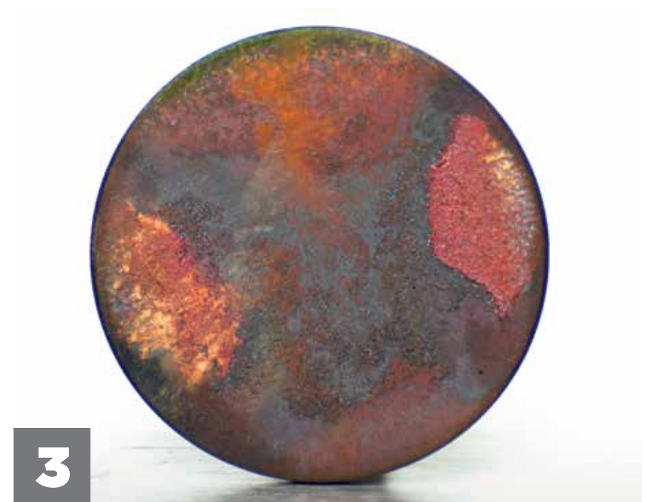
3 Burn pattern migrates inward.