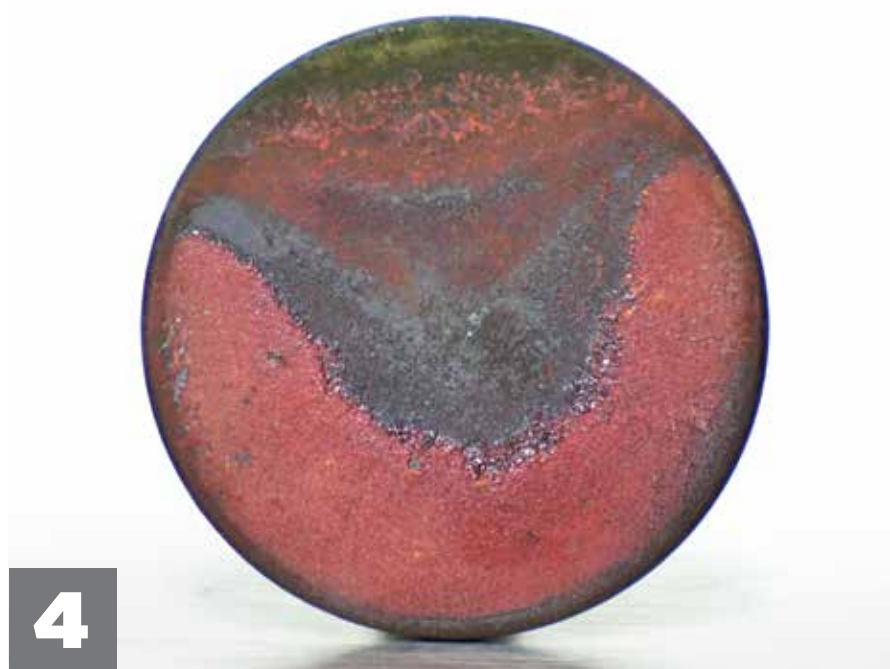
4 GREEN MEANS STOP. The green area at the top shows this valve should be replaced immediately. (Note how the uneven burn patterns match the heat distribution chart.)