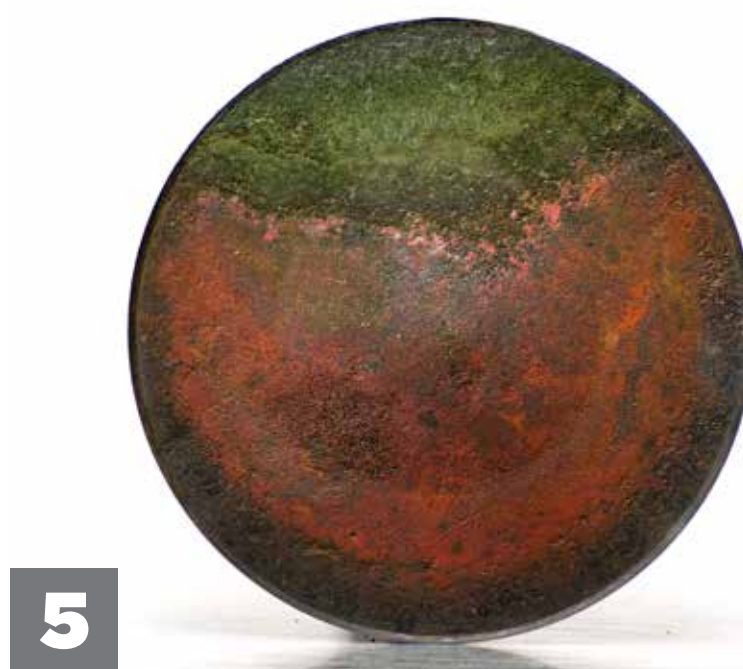
5 Green crescent progresses toward center with valve cracking and failure a serious danger.