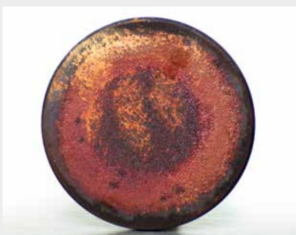
Don't be alarmed by the bright color, or deposits around the edges. The symmetrical pattern shows this valve is just fine.