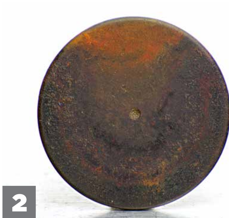
2 Crescent-shape, discolored burn pattern developing at upper edge.