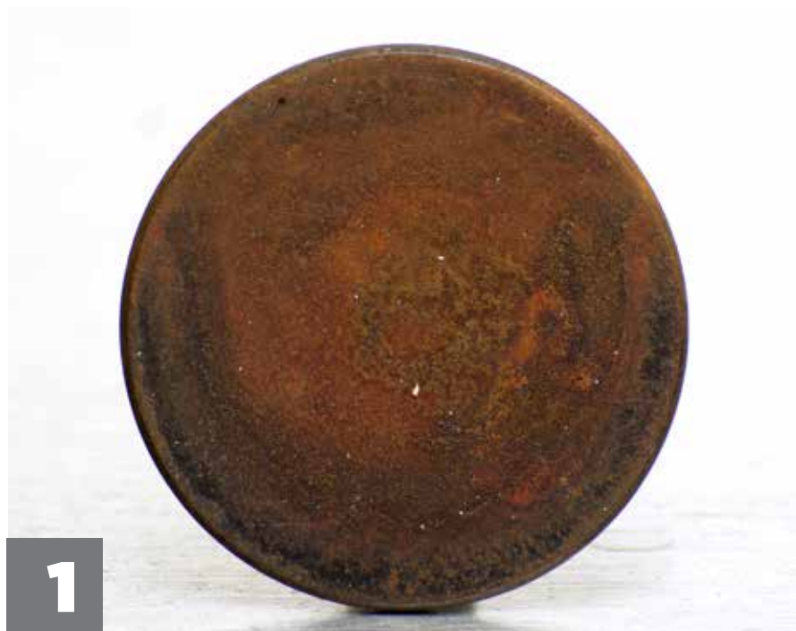
1 First indication: Circular color pattern is slightly uneven and nonsymmetrical.