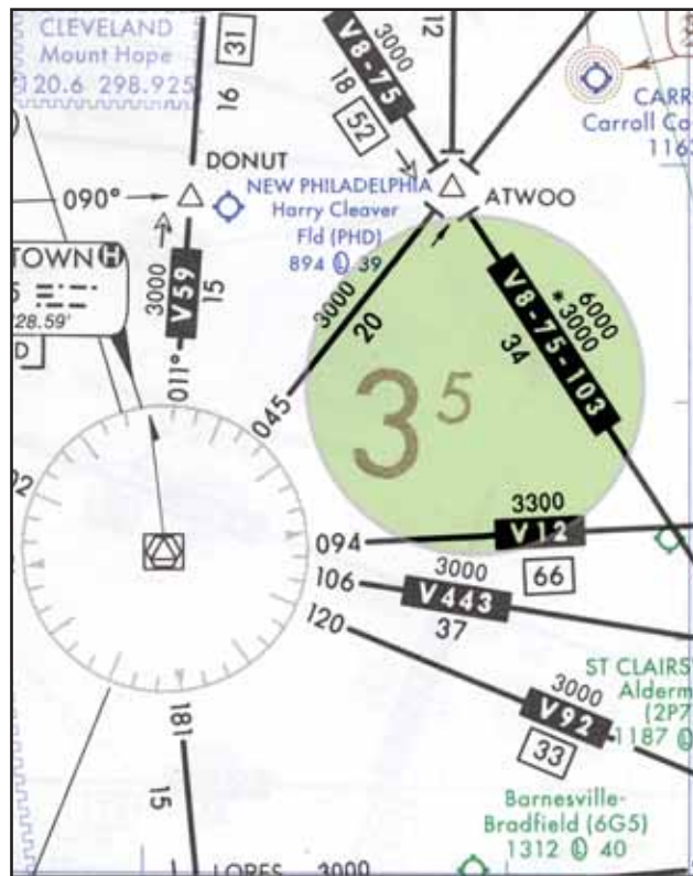
Figure 2: IFR enroute low altitude chart showing an OROCA of 3,500 feet.

When planning a flight look at the MEF and OROCA. Be sure the planned cruise altitude is above the MEF or OROCA. If you have to descend during a flight due to weather use these altitudes as your de facto minimum cruise altitude. When planning your flight remember that the MEF and OROCA are listed in msl and ceilings are in agl. Ensure that your planned altitude will not only keep you clear of obstacles, but also keep you clear of the clouds.