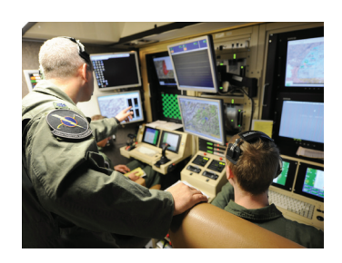
A VIEW INSIDE THE GROUND CONTROL STATION OF AN MQ-9 DURING A TRAINING MISSION.

Pilots or operators fly the aircraft remotely via control links from Ground Control Stations (GCS). A GCS may be a portable station—often used for smaller aircraft launching from a field—or a fixed station used to fly larger aircraft such as the Predator and Global Hawk.