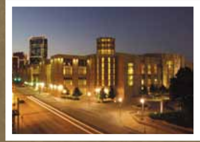
Fort Worth Convention Center 1201 Houston Street Fort Worth, TX 76102

Booths may not be dismantled before 4 PM on Saturday, October 12.