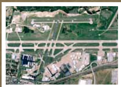
Fort Worth Meacham Int'l. Airport 4201 N Main St Fort Worth, TX 76106