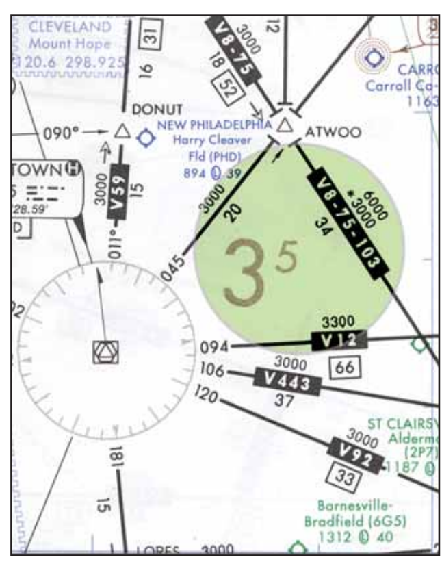
Figure 2: IFR enroute low altitude chart showing an OROCA of 3,500 feet.

When planning a flight look at the MEF and OROCA. Be sure the planned cruise altitude is above the MEF or OROCA. If you have to descend during a flight due to weather use these altitudes as your de facto <u>minimum</u> cruise altitude. When planning your flight remember that the MEF and OROCA are listed in msl and ceilings are in agl. Ensure that your planned altitude will not only keep you clear of obstacles, but also keep you clear of the clouds.