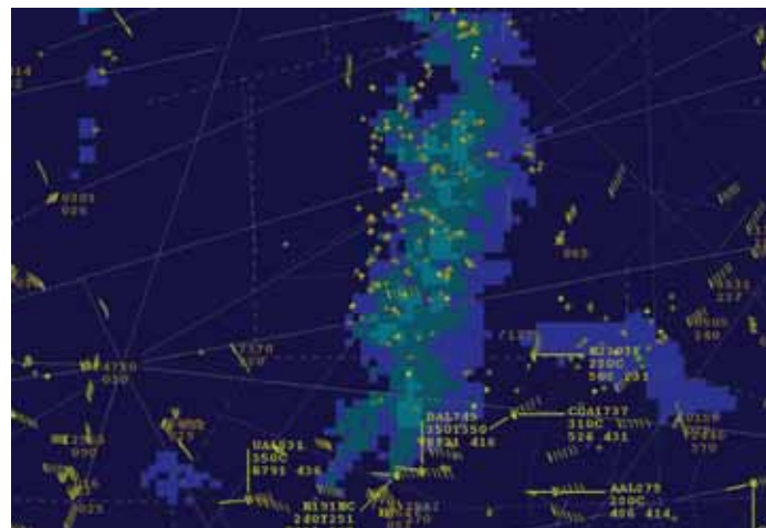
WARP radar returns on a controller's scope.

Remember that WARP does not display "light" precipitation.