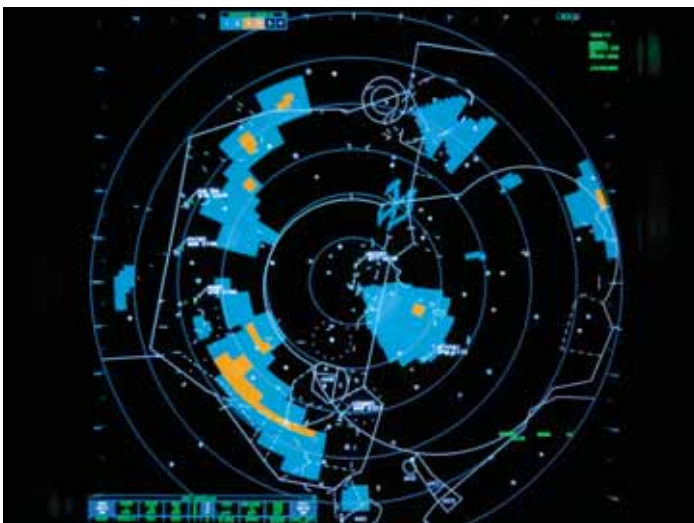
ASR returns on a controller's scope.

"light" (level 1) to "extreme" (level 6). Don't expect to hear controllers talking about "level three cells," though. Recent procedural changes have resulted in a new reporting system for controllers using ASR: They now describe precipitation to pilots as light, moderate, heavy and extreme (see Figure 1 above).