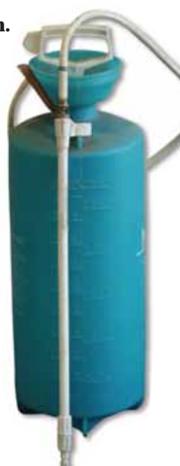
A garden sprayer can be used to help remove frost.

in a spray can is inexpensive and can be purchased at gas stations and department stores. Do not use it on aircraft windshields or windows. It's the easiest to carry and,