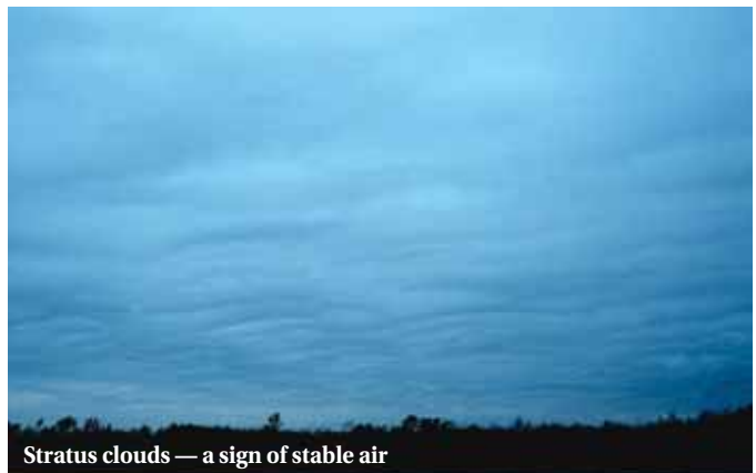
Stratus clouds — a sign of stable air