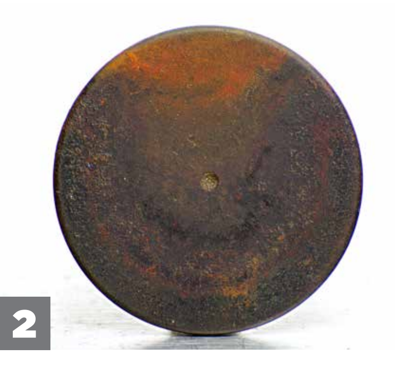
Crescent-shape, discolored burn pattern developing at upper edge.