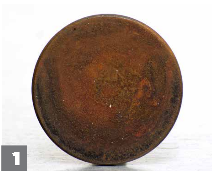
First indication: Circular color pattern is slightly uneven and nonsymmetrical.