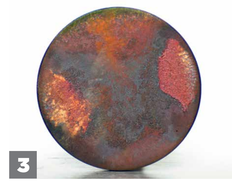
Burn pattern migrates inward.