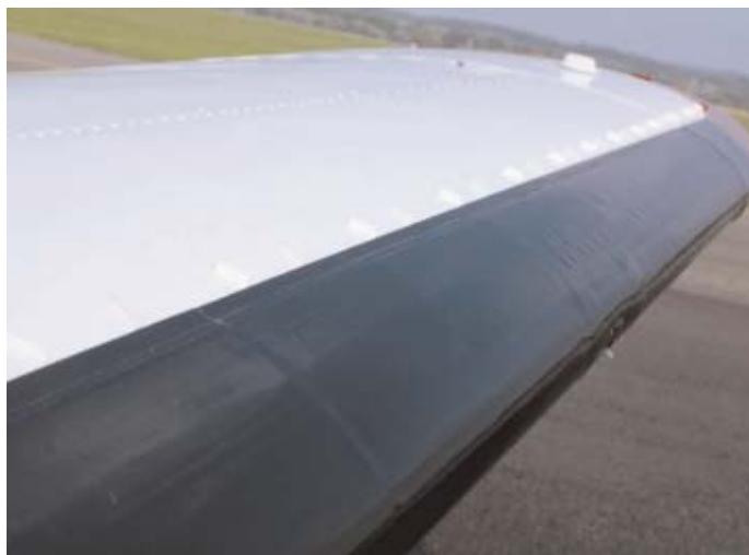
Pneumatic boots shown on leading edge of wing