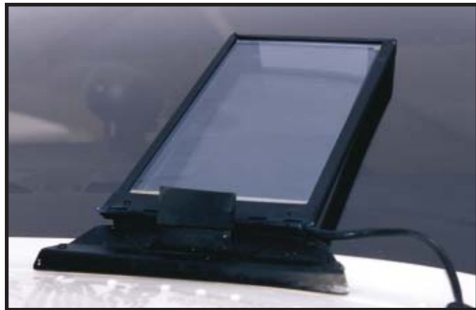
Non-hazard: Electrically heated windshield

In addition, there is no requirement to have a heated stall warning sensor, so a stall warning system may not be reliable in icing conditions.