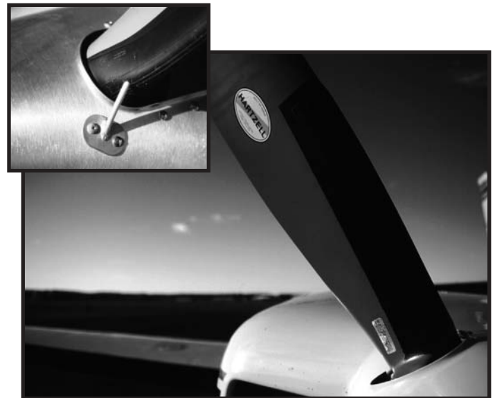
Non-hazard: Alcohol (inset) and electrically heated prop anti-ice equipment

Non-hazard systems must show in dry air that installation of the system does not affect performance, stalls, controllability, stability, trim, ground/water handling, vibration and buffet, and if applicable, high speed characteristics. There is no requirement to evaluate these characteristics in icing conditions. The certification requires the airplane and essential systems be protected against catastrophic effects from lightning. All electrically operated components must be electrically bonded to prevent electromagnetic interference. A non-hazard ice protection system is not considered an essential system.