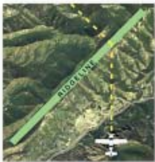
Recommended procedure for crossing a ridge.

Since flying direct to your destination is usually not feasible, preflight planning must include a careful evaluation of routes and altitudes.