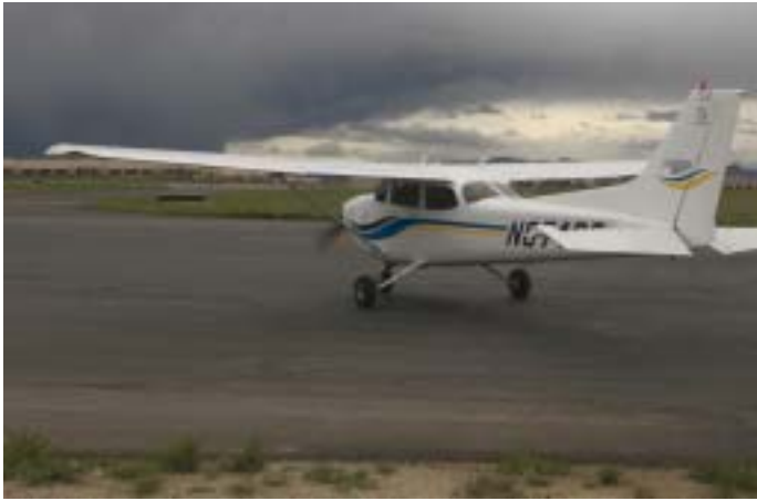
Mountain weather can change quickly.