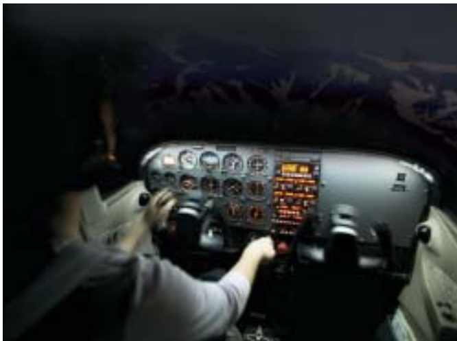
If flying in the mountains at night, consider going IFR.

Nighttime in the mountains can be especially unnerving. Most mountainous areas are sparsely populated, and it can get very dark very quickly. Scarcity of lights on the ground, particularly without a full, bright moon, can bring on spatial disorientation. Experienced pilots always treat night flights as instrument flights. VFR-only pilots should seriously consider postponing a night mountain flight until daylight hours, even in good weather.