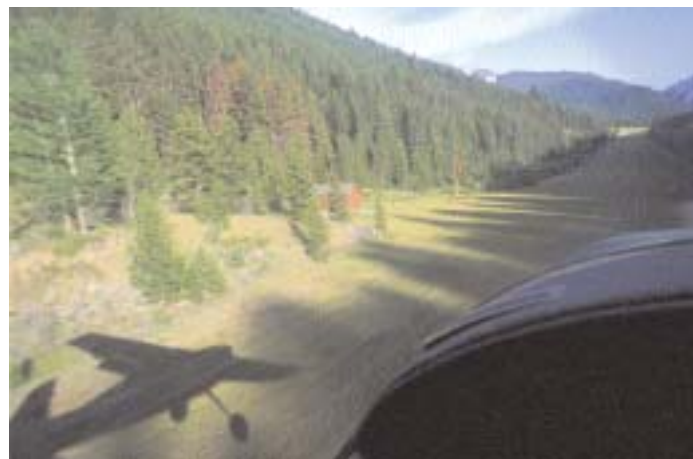
Approach to a grass runway.

Sloping runways are common in mountainous areas. One example is Sedona, Arizona. This popular tourist destination offers a well-maintained airport and breath-taking scenery, but the Airport/Facility Directory (A/FD) points out that Sedona's 5,132 foot runway has a 1.8% slope. That may not sound like much, but do the math. This runway slopes more than 92 feet from one end to the other! By comparison, most control towers are only about 75 feet tall.