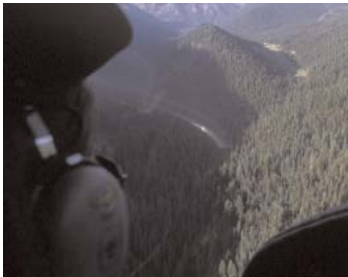
Airplane turning final for an "unimproved" mountain runway.

Taking off downhill can decrease the required takeoff roll when departing an airport with a sloping runway. If you are taking off downhill with a light tailwind, keep in mind that landing traffic will most likely be arriving in the opposite direction. Accepted takeoff and landing procedures will differ from one airport to another, so it's best to talk to a local pilot before venturing out on your own.