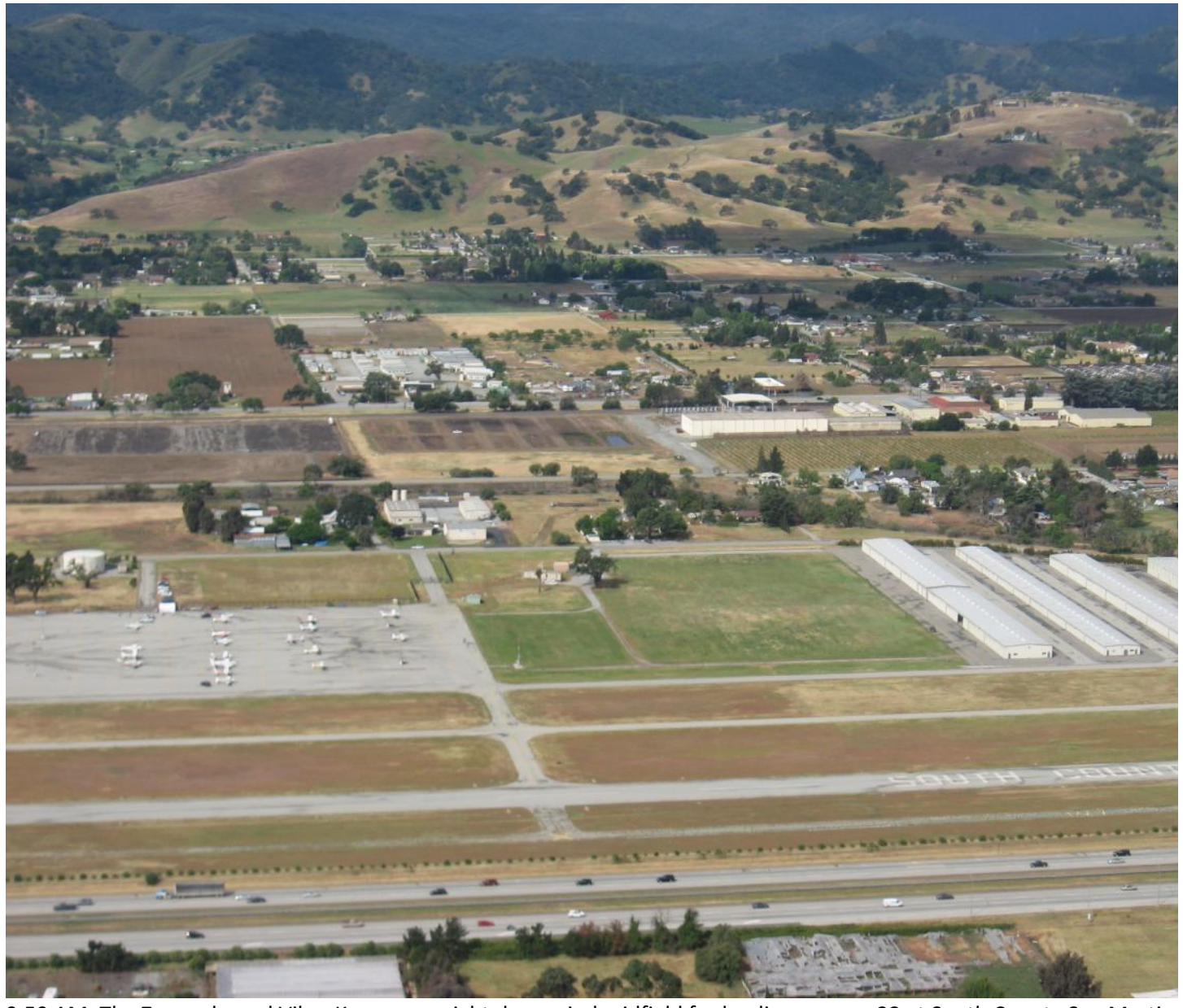
9:59 AM: The Zerwecks and Vikas Kapur on a right downwind midfield for landing runway 32 at South County San Martin airport. The operations tent is the white speck at the edge of the ramp next to the leftmost access road. The airport is conveniently situated next to the highway 101 one of California's main north-south transportation arteries.