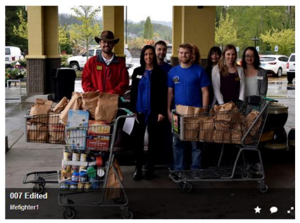
The Cornwall Chuch study group bands together with the manager of their local Fred Meyers grocery store to make a food donation to the St Joseph's Family Center in Gilroy that is benefitting from all the food transported and collected during the SCAPA DART mobilization exercise