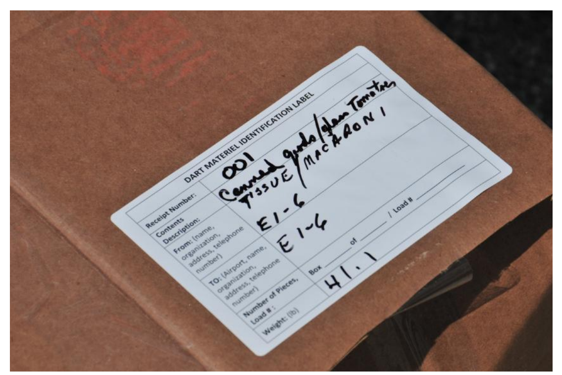
A label is placed on each item so that the ramp crew can use the Aircraft load sheet to identify which items from the pile go into which airplanes for transport. The ramp crew will assign the Load # from the load sheet that will be prepared later.