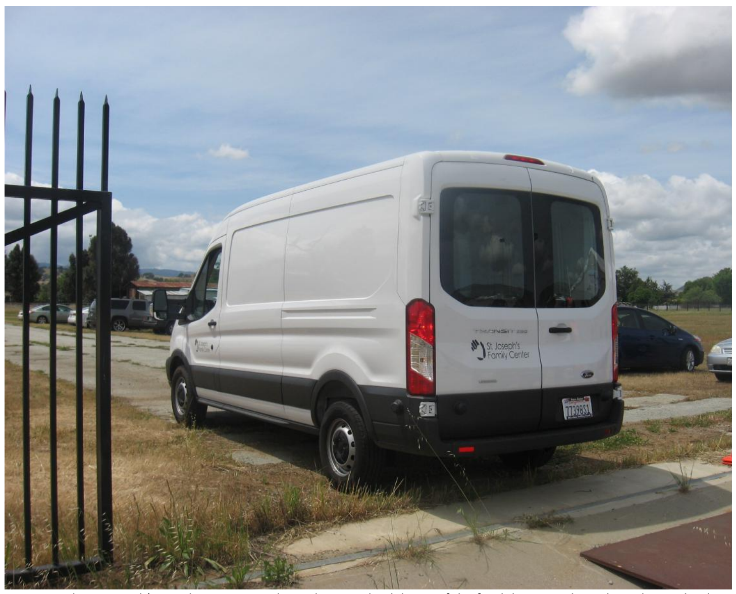
1:40 PM The St Joseph's Family Center van showed up to take delivery of the food donations brought in during the day. Totals were relatively modest, about 498 pounds for this exercise. GA aircraft were said to have transported about one half million pounds of food into the Watsonville Airport to feed the cities of Watsonville and Santa Cruz in the emergency airlift following the Loma Prieta earthquake.