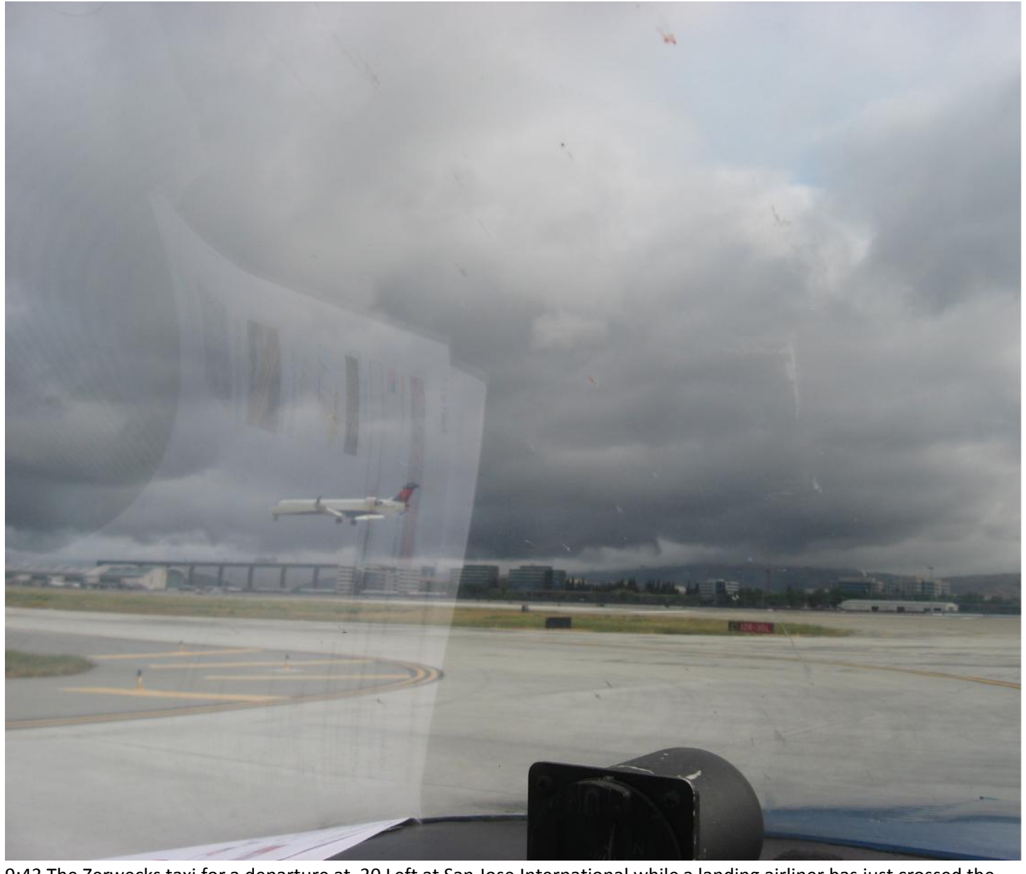
9:43 The Zerwecks taxi for a departure at 30 Left at San Jose International while a landing airliner has just crossed the threshold.