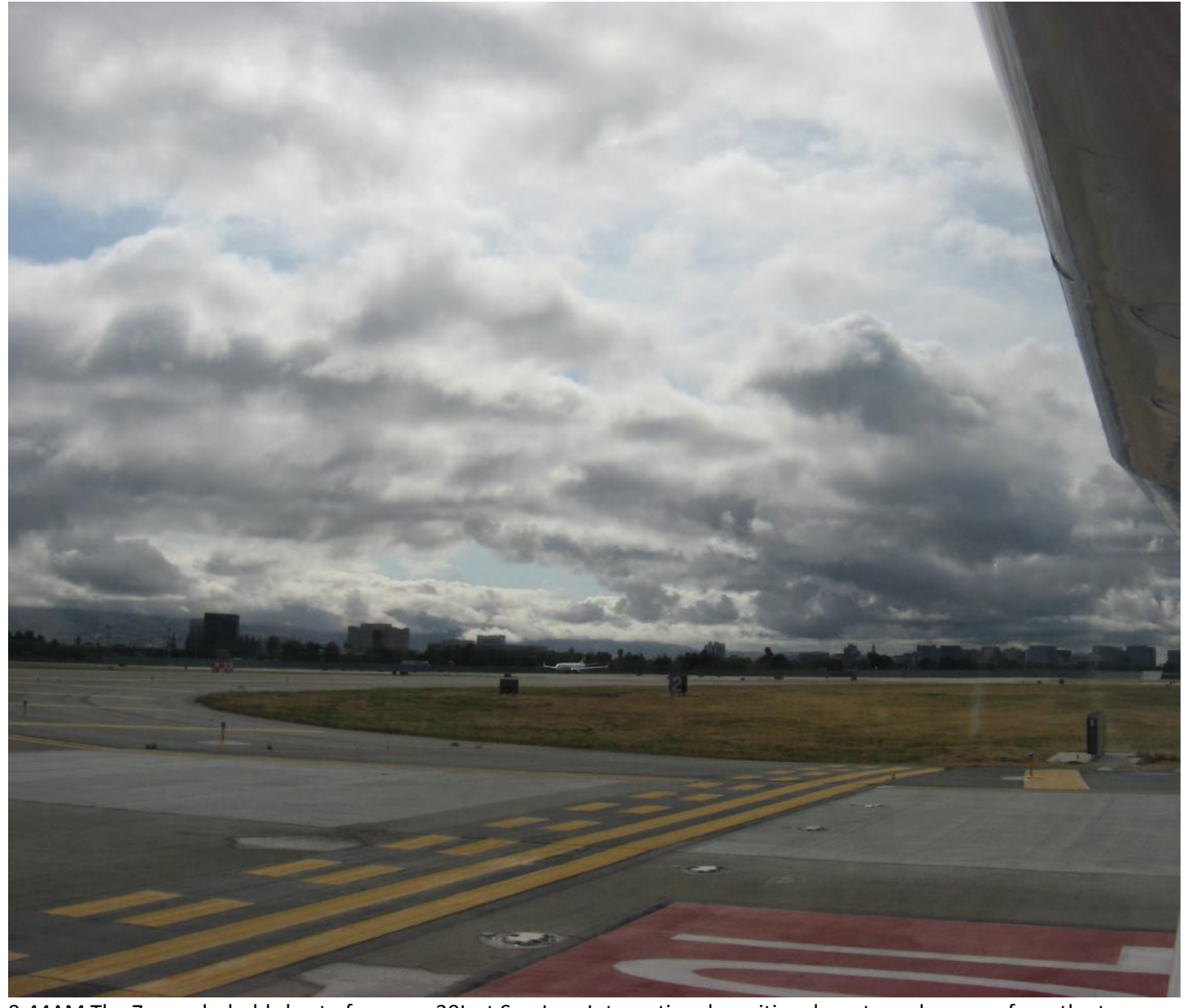
9:44AM The Zerwecks hold short of runway 30L at San Jose International awaiting departure clearance from the tower.