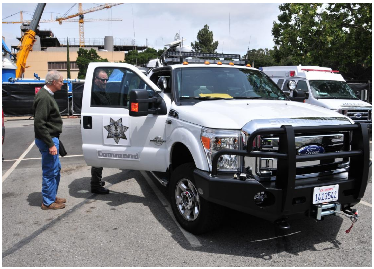
12:51 PM The Palo Alto Emergency Services command center looks right at home in the Stanford Hospital Emergency Room parking lot. Overall, it took us about 1.5 hours from check-in to delivery to get this ambulatory patient to the emergency room, with ground transportation and pilot and hospital staff all pre-cleared to accept and support the operation.