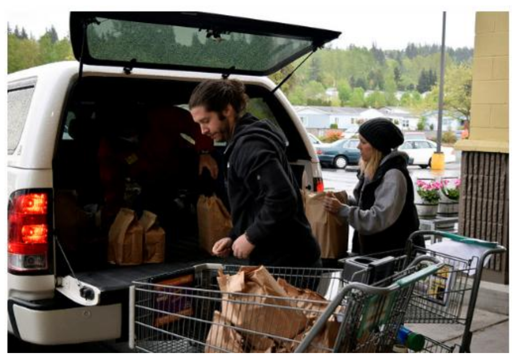
They transported their food in a member's car to the Bellingham airport where...