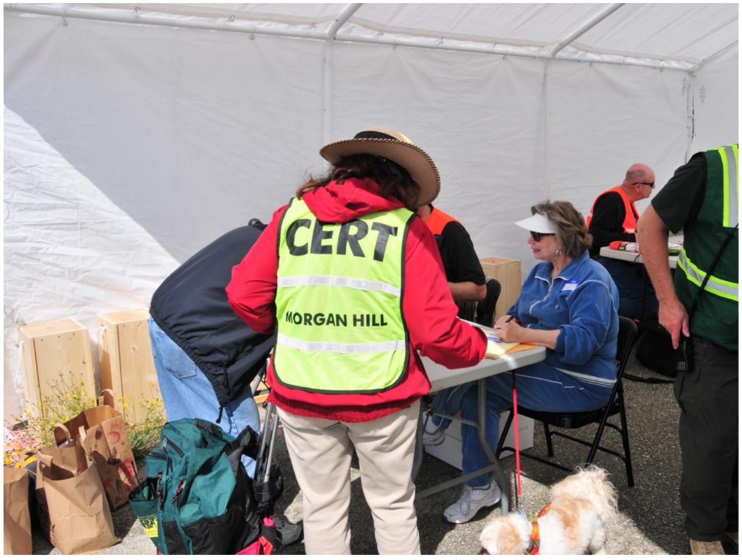
10:30 AM Volunteers are being signed in for duty at the volunteer sign in desk. The local CERT (Community Emergency Response Teams) from Morgan Hill and Gilroy participated both as volunteers to man the duty stations, as donors of food, and as passengers to be flown in missions simulating ambulatory medical transport and evacuation. Although we did not simulate it during the exercise, CERT also stood ready to help the local population get to the airport, and to deliver goods and people from the airport to places where they were needed in the community.