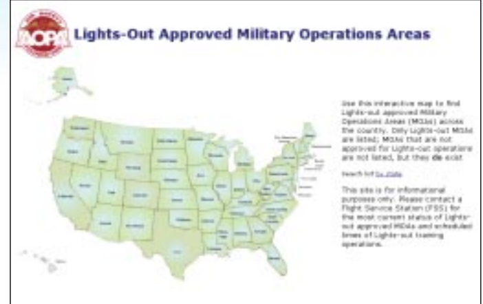
Figure 1: www.aopa.org/asf/publications/sa21_moa.html

Although this exemption may not appear to be in the best interest of safety, a number of safeguards have been implemented. The GA industry, including AOPA, worked tirelessly with the military and the FAA to reach an agreement allowing the military to train for vital missions while maintaining safe skies for everyone.